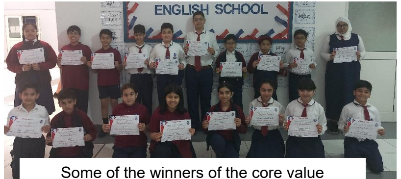
Some of the winners of the core value certificates for Co-operation.

As Always, I wish you an enjoyable and relaxing weekend.