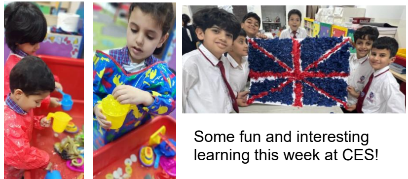
Some fun and interesting learning this week at CES!