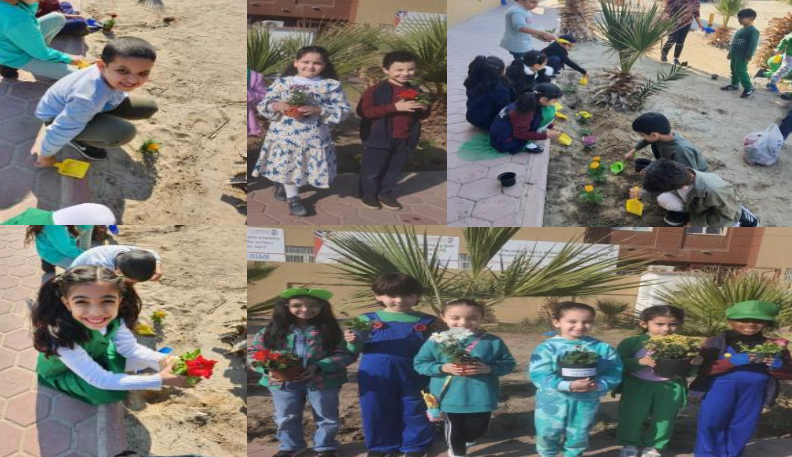
Secondary Mid Term Exams- December 2023